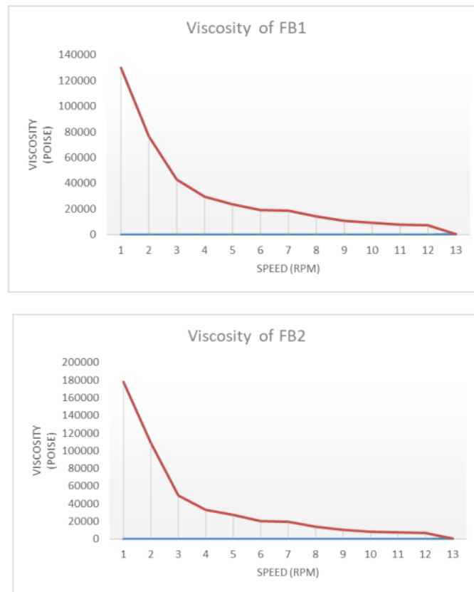
Figure 2. Viscosity values of Peel Off face mask yogurt fresh cow's milk and UHT milk at 1% and 2%

Decomposition of solids by bacteria lactic acid in the fermentation process affects viscosity [42] in vitro assessment of total phenolic, total flavonoid and sunscreen activities of crude ethanolic extract of belimbing wuluh ( Averrhoa bilimbi ) fruits and leaves). Lactose, glucose, or other carbohydrates will be fermented by lactic acid bacteria and affects the viscosity of fermented milk. The higher the spindle speed, the viscosity of the peel-off face mask all groups are decreases. It was similar to the result by [44] that the viscosity decreased with the increasing spindle speed. It showed pseudoplastic flow type. The concentration of PVA and HPMC will affect viscosity and spreadability. The higher polymer concentration can cause the consistency of the peel-off face mask to become unpleasant and sticky [45], and the spreadability decrease. In this research, the formulas of peel-off face mask all group are similar, but the concentration of yogurt added is different. The thickest peel-off face mask is FB2 with 2% UHT milk yogurt followed by FA2 with 2% fresh cow's milk yogurt. It indicates the higher concentration of yogurt added, the viscosity increase.