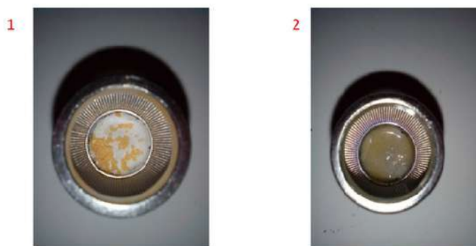
Figure 3. Swelling index of ranitidine microgranules (1: initial, 2: final)

The drug loaded microgranules were showing the most swelling index in batch F6, which contain aloe vera powder 8% and carbopol 934P 15% (Fig. 3). Aloe vera powder has strong absorption than aloe vera gel because its contain lower water content due to drying process. The more concentration of aloe vera powder, the more swelling index because of the more water absorption. In acidic medium, carbopol 934P are in a collapsed form due to hydrogen bonding, which supporting the swelling of microgranules [19].