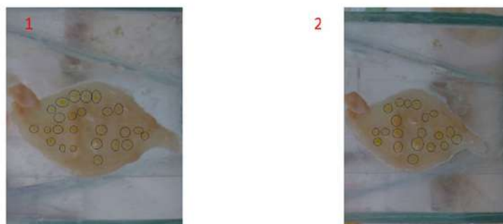
Figure 4. In vitro mucoadhesive of ranitidine microgranules (1: initial, 2: final)

contact between the mucoadhesive and the mucous membrane, with spreading and swelling of the formulation, initiating its deep contact with the mucous layer. In the consolidation step, the mucoadhesive materials are activated by the presence of moisture. Moisture plasticizes the system, allowing the mucoadhesive molecules to break free and to link up by weak Vander Waals and hydrogen bonds [20].