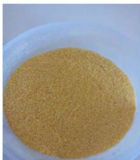
Figure 1. Ranitidine microgranules

gel and powder (Fig 1). Dehydration of samples is necessary to improve their stability and less susceptible to spoiling during storage[13]. Freeze drying method is the best choice to dehydration the sample due to lower temperature and pressure (0°C and 4,58 torr). The dried samples were sieved through no. 60 mesh, characterized by loose powder, white-brownish, odorless, and tasteless.